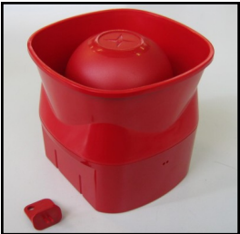
Picture 1 - General overview of the device and its opening key

*** These lifespan values refer to the device being programmed with a control signals transmission period of 12 seconds. If the device is activated for 30 seconds a week for test, the primary battery's lifespan reduces to 4.1 years (with the sounder activated and the volume set at maximum level).