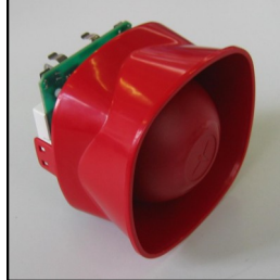
Picture 3 - Sounder device