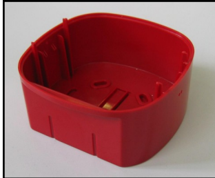
Picture 2 - Wall base