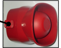
Picture 5 - Sounder device removal from the wall base

KEY TO REMOVE THE SOUNDER DEVICE FROM ITS WALL BASE